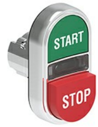
Double-touch actuators, spring return white indicator - One extended and one flush pushbuttons LPSBL72