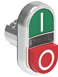
Double-touch actuators, spring return white indicator - One extended and one flush pushbuttons LPSBL72