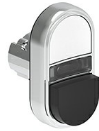
Double-touch actuators, spring return white indicator - One extended and one flush pushbuttons LPSBL72