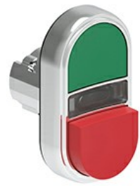
Double-touch actuators, spring return white indicator - One extended and one flush pushbuttons LPSBL72