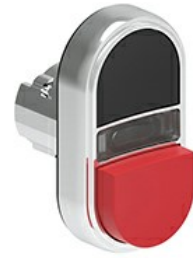
Double-touch actuators, spring return white indicator - One extended and one flush pushbuttons LPSBL72