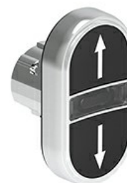
Double-touch actuators, spring return white indicator - Two flush pushbuttons LPSBL71