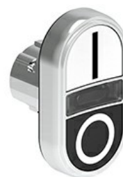
Double-touch actuators, spring return white indicator - Two flush pushbuttons LPSBL71