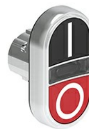
Double-touch actuators, spring return white indicator - Two flush pushbuttons LPSBL71