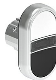
Double-touch actuators, spring return white indicator - Two flush pushbuttons LPSBL71