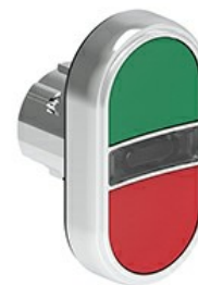
Double-touch actuators, spring return white indicator - Two flush pushbuttons LPSBL71