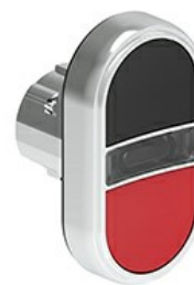
Double-touch actuators, spring return white indicator - Two flush pushbuttons LPSBL71