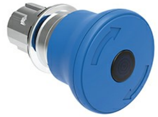
Illuminated mushroom head button actuators - Latch, turn to release Ø 40mm/1.6" LPSBL66