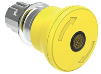
Illuminated mushroom head button actuators - Latch, turn to release Ø 40mm/1.6" LPSBL66