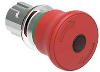
Illuminated mushroom head button actuators - Latch, turn to release Ø 40mm/1.6" LPSBL66