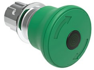
Illuminated mushroom head button actuators - Latch, turn to release Ø 40mm/1.6" LPSBL66