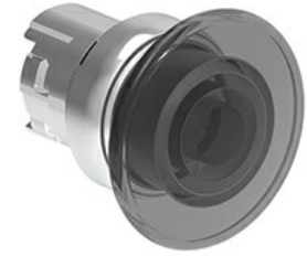
Illuminated mushroom head button actuators - Spring return Ø 40mm/1.6" LPSBL61