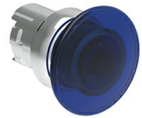
Illuminated mushroom head button actuators - Spring return Ø 40mm/1.6" LPSBL61