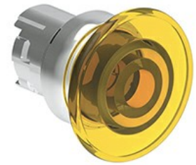
Illuminated mushroom head button actuators - Spring return Ø 40mm/1.6" LPSBL61