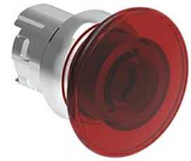
Illuminated mushroom head button actuators - Spring return Ø 40mm/1.6" LPSBL61