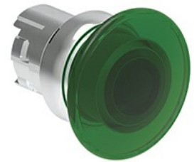
Illuminated mushroom head button actuators - Spring return Ø 40mm/1.6" LPSBL61