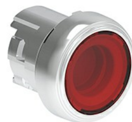
Illuminated button actuators, spring return - Flush LPSBL10