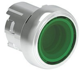
Illuminated button actuators, spring return - Flush LPSBL10