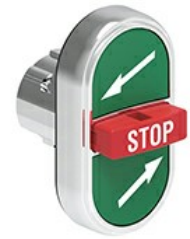
Triple-touch actuators, spring return - One middle extended buttons LPSB73