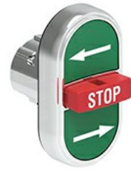
Triple-touch actuators, spring return - One middle extended buttons LPSB73