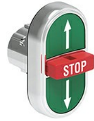
Triple-touch actuators, spring return - One middle extended buttons LPSB73