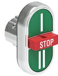
Triple-touch actuators, spring return - One middle extended buttons LPSB73