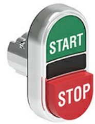
Double-touch actuators, spring return - One extended and one flush pushbuttons LPSB72