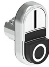
Double-touch actuators, spring return - One extended and one flush pushbuttons LPSB72