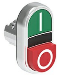
Double-touch actuators, spring return - One extended and one flush pushbuttons LPSB72