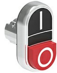
Double-touch actuators, spring return - One extended and one flush pushbuttons LPSB72