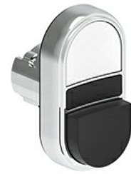
Double-touch actuators, spring return - One extended and one flush pushbuttons LPSB72