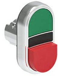
Double-touch actuators, spring return - One extended and one flush pushbuttons LPSB72