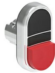
Double-touch actuators, spring return - One extended and one flush pushbuttons LPSB72