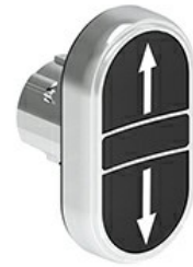
Double-touch actuators, spring return - two flush pushbuttons LPSB71