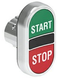
Double-touch actuators, spring return - two flush pushbuttons LPSB71