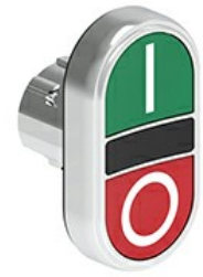
Double-touch actuators, spring return - two flush pushbuttons LPSB71