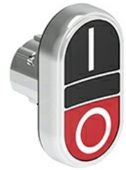
Double-touch actuators, spring return - two flush pushbuttons LPSB71