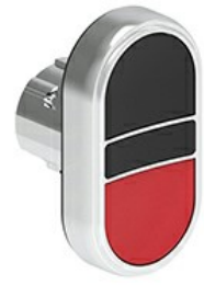
Double-touch actuators, spring return - two flush pushbuttons LPSB71