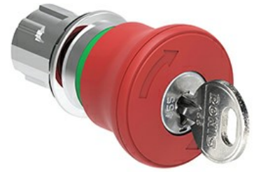
Mushroom head pushbutton, Latch, turn key to release Ø 40mm/1.6" LPSB684