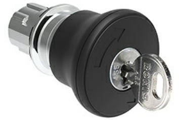
Mushroom head pushbutton, Latch, turn key to release Ø 40mm/1.6" LPSB684