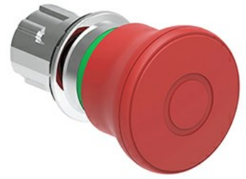
Mushroom head pushbutton, Latch, pull to release Ø 40mm/1.6" LPSB674