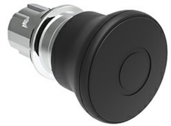
Mushroom head pushbutton, Latch, pull to release Ø 40mm/1.6" LPSB674