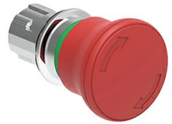
Mushroom head pushbutton, Latch, turn to release Ø 40mm/1.6" LPSB664