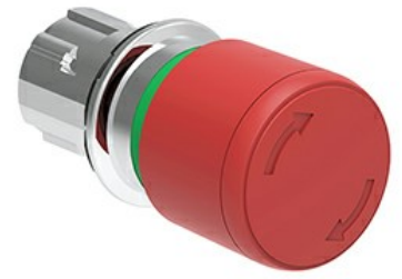
Mushroom head pushbutton, Latch, turn to release Ø 30mm/1.2" LPSB663