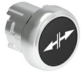
Pushbutton actuators, spring return, with symbol LPSB15