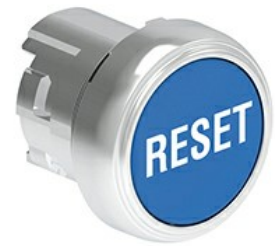
Pushbutton actuators, spring return, with symbol LPSB11