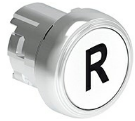
Pushbutton actuators, spring return, with symbol LPSB11