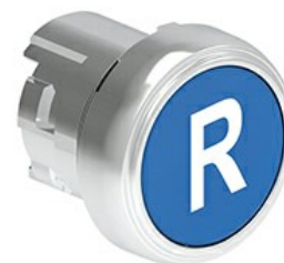
Pushbutton actuators, spring return, with symbol LPSB11