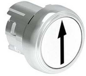
Pushbutton actuators, spring return, with symbol LPSB11