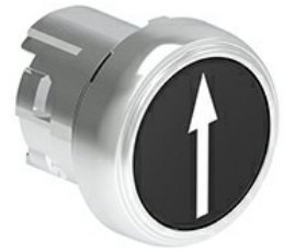
Pushbutton actuators, spring return, with symbol LPSB11